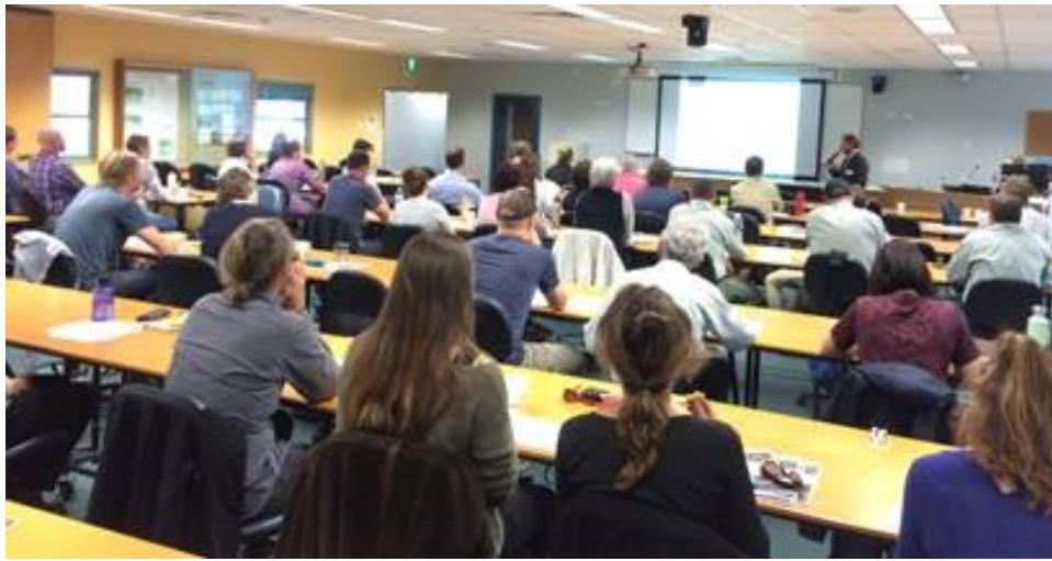
Avid Biodiversity Node show participants in Armidale

Thanks to everyone who jumped onboard Macquarie University's unstoppable Node Show, which delivered the latest research and presented new methods and web tools to support adaptation planning for species and ecosystems across the state. Over 220 natural resource managers, decision-makers, scientists and conservation practitioners from a range of sectors attended the seven workshops and engaged with the Node's leading adaptation researchers and other practitioners. There was great interest in some of the emerging tools such as the new Climate Refugia locator .